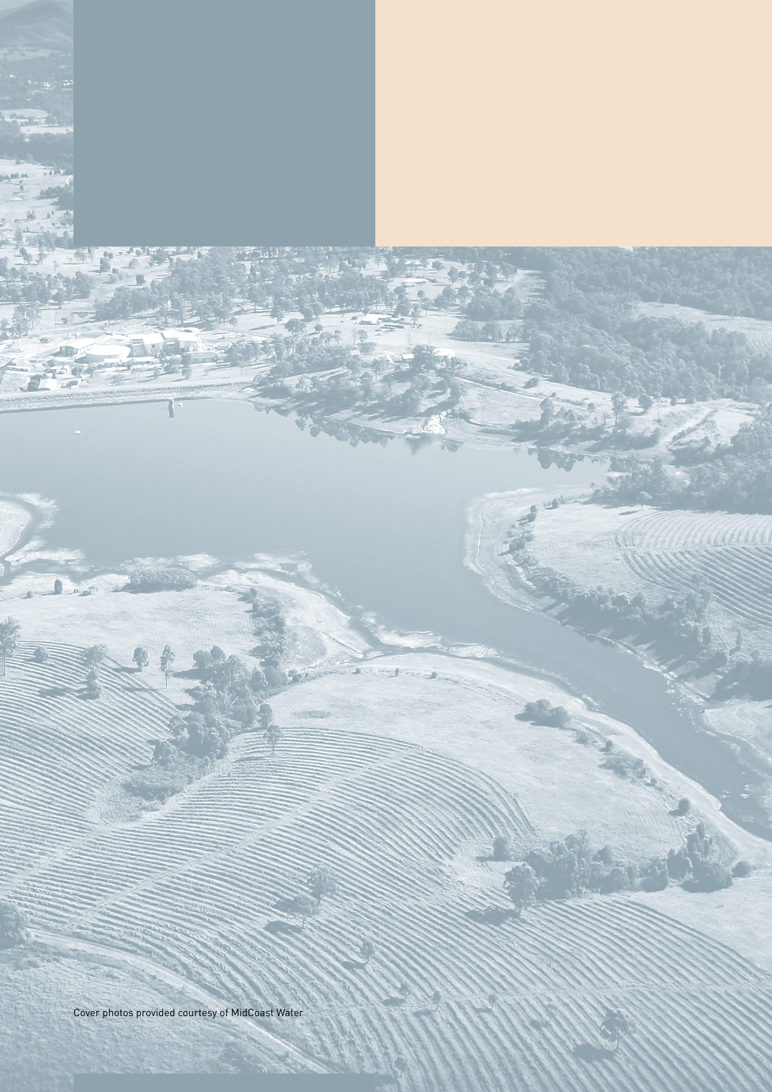
Cover photos provided courtesy of MidCoast Water